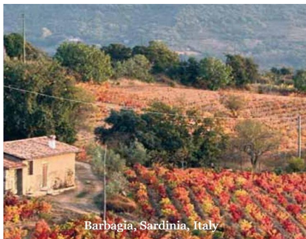
Barbagia, Sardinia, Italy

mountainous region of central Sardinia, in this Part 1 series. Barbagians view anything